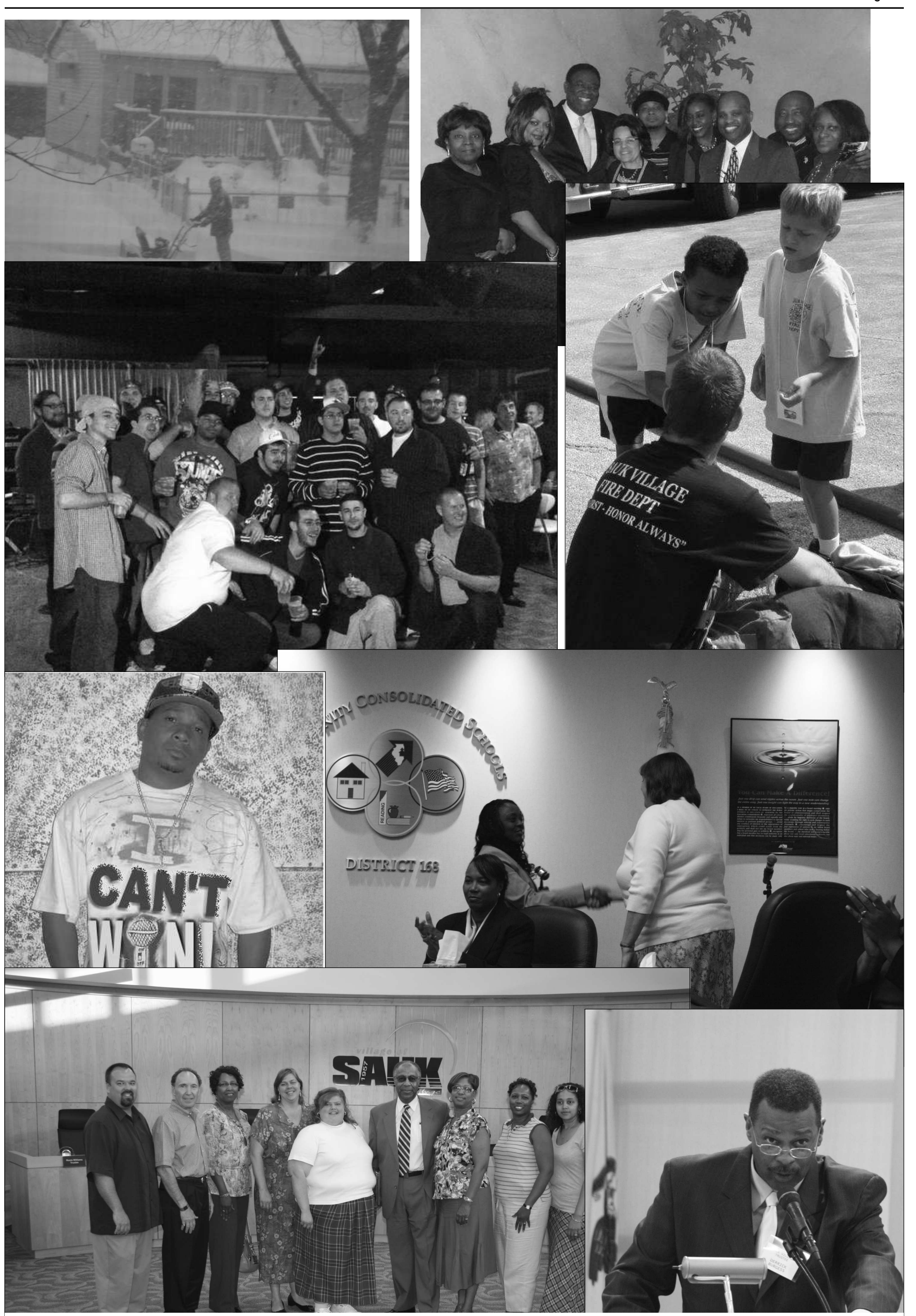
2011 in Pictures