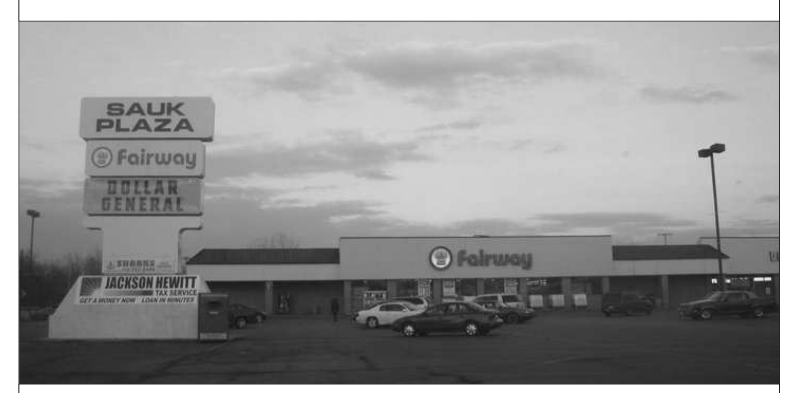
Support your local Grocery Store