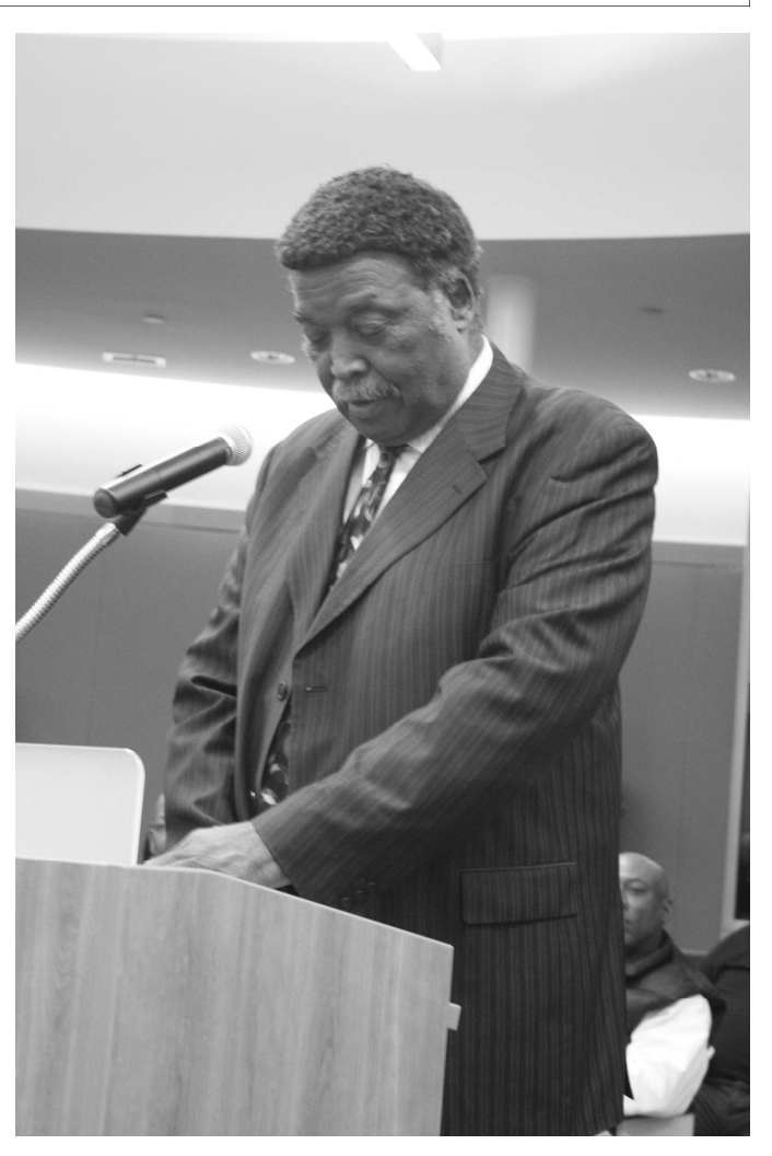
Outside Influence? You decide!

I think it's long over due that the Village needs to come together and stop the racism. It has no place in Village Government or in Sauk Village. Some tried to play the racism card in the last election in April and that strategy completely backfired and it will once again. Racism is hate! Stop the hate!