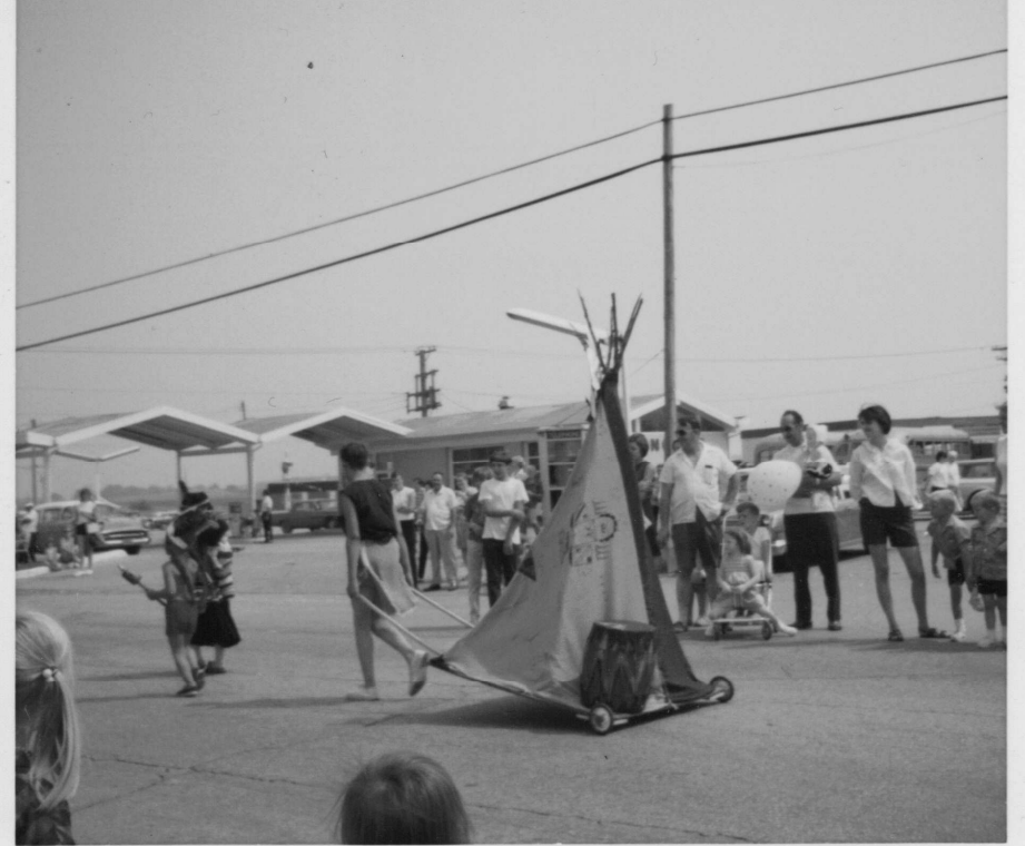
Notice the old Sinclair Gas Station at the corner of Sauk Trail and Torrence Avenue. Currently the US Bank