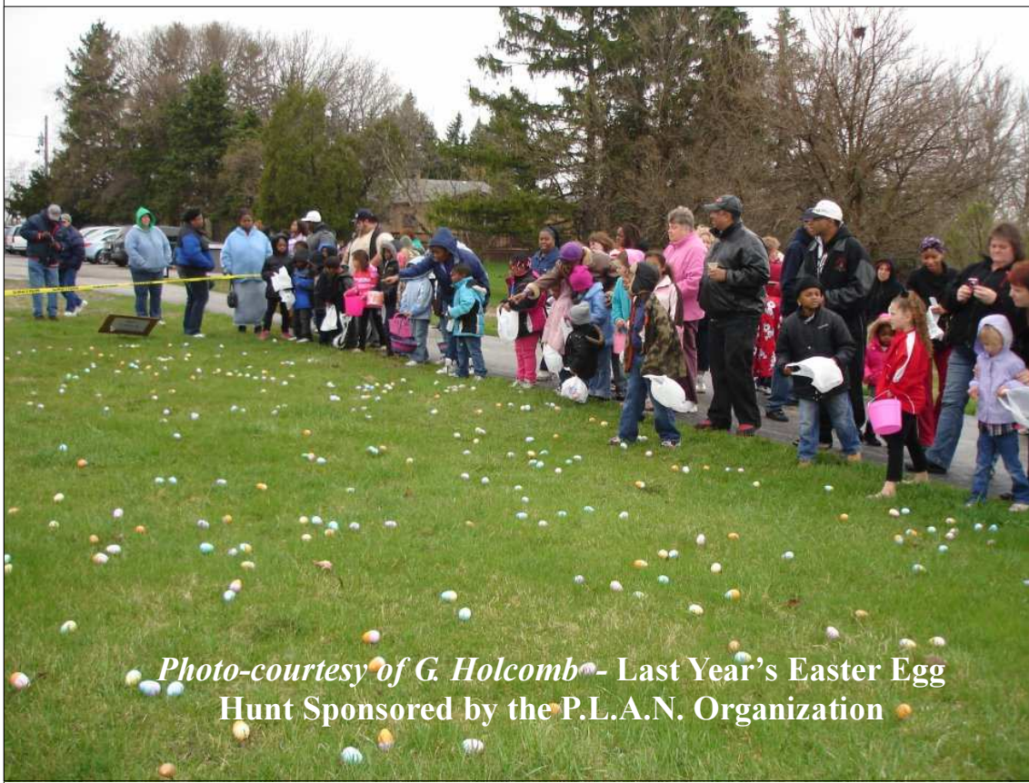
Last Year's Easter Egg Hunt Sponsored by the P.L.A.N. Organization

You can buy raffle tickets at the McConathy Public Library for $2.00 each. All proceeds will be used for the event.